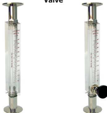
Product Code : SDATC

Acrylic Body Rotameter With Triclover Connection with & without Isolation Valve