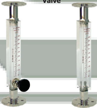
Product Code : SDTAIV

Acrylic Body Rotameter with Flanged Connection with & without Isolation Valve