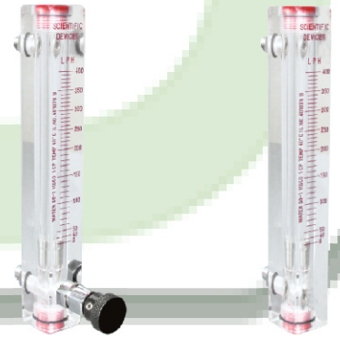
Product Code : SDTRCIV

Acrylic Body Rotameter with & without Isolation Valve