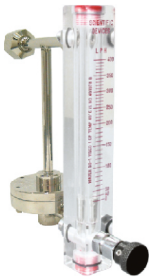
Product Code : STADPR

Acrylic Body Rotameter with Isolation Valve And DP Regulator