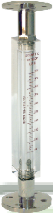
Product Code : SDA